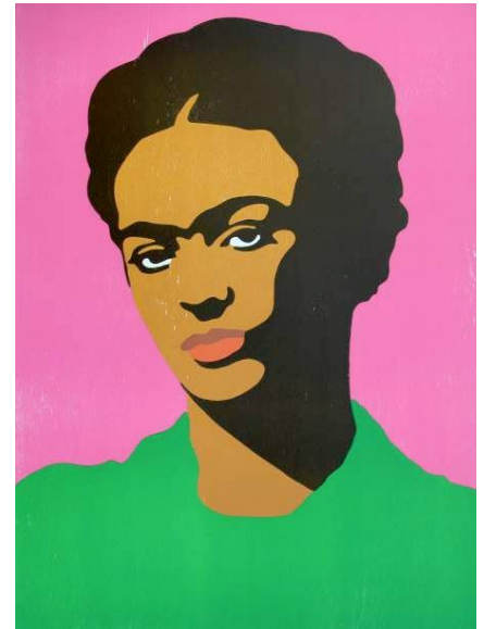
Rupert Garcia, Frida Kahlo , 2002, woodcut, 35.5 x 24.5".

Advance ticket purchase required, visit www.bedfordgallery.org/frida