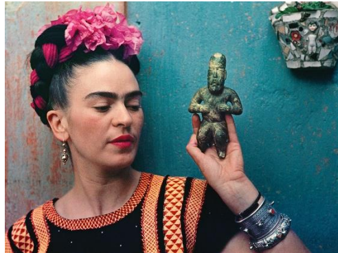
Nickolas Muray. Frida with Olmeca Figurine , 1939, carbon process print, 10.75 x 15.75", courtesy of the Nickolas Muray Photo Archives and GuestCurator Traveling Exhibitions