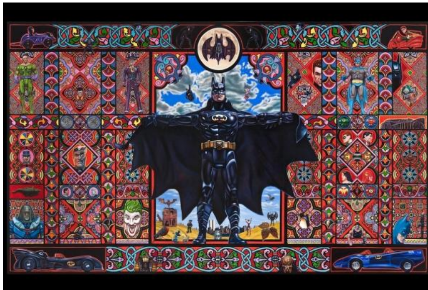
Robert Xavier-Burden, The Holy Batman , 2013, oil on canvas, 85" x 145"

Right: Spiderman , 2003, hand knit acrylic and buttons, 80" x 23" x 6" Collection of Nowhere Ltd.